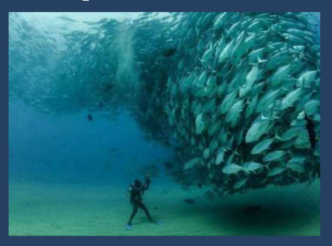
Please choose only sustainable fish